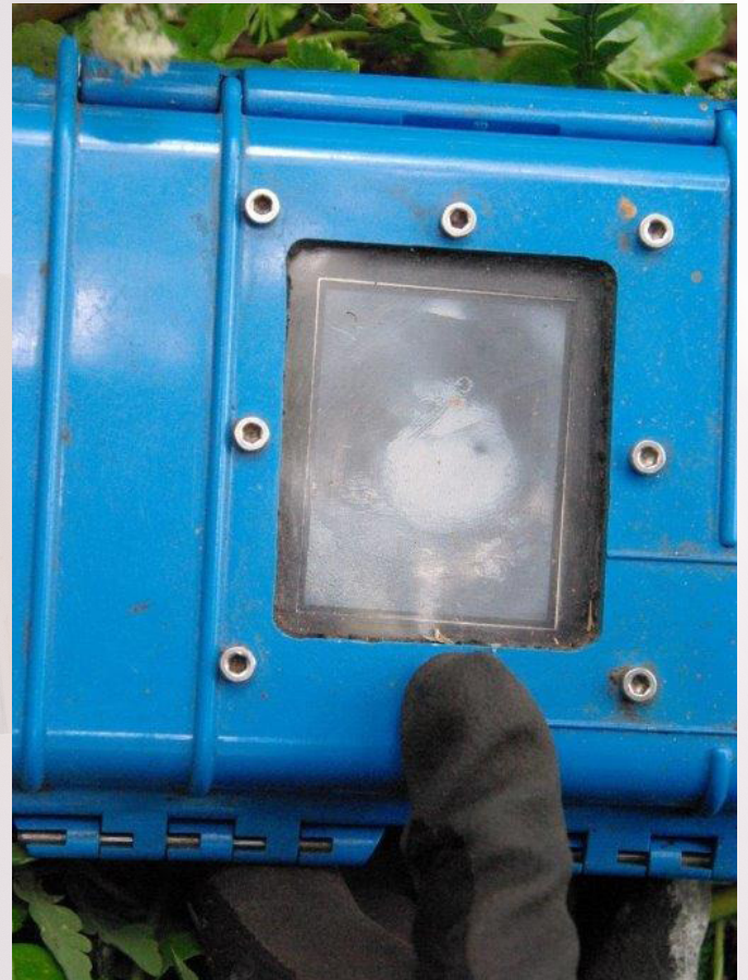
Photo: Image on the 'burrowscope' monitor of a short-tailed shearwater adult on a nest within a burrow

FOMI are very grateful for all funding support of their on-island projects. The 2019/20 season was funded by a generous donation by the Pennicott Foundation and FOMI general fundraising. Tasmania Parks and Wildlife Service (PWS) provided both logistical support and transport cost-sharing as part of the FOMI Working Bees and PWS volunteer caretaker support. Helicopter Resources also provide support for the FOMI Working Bees.