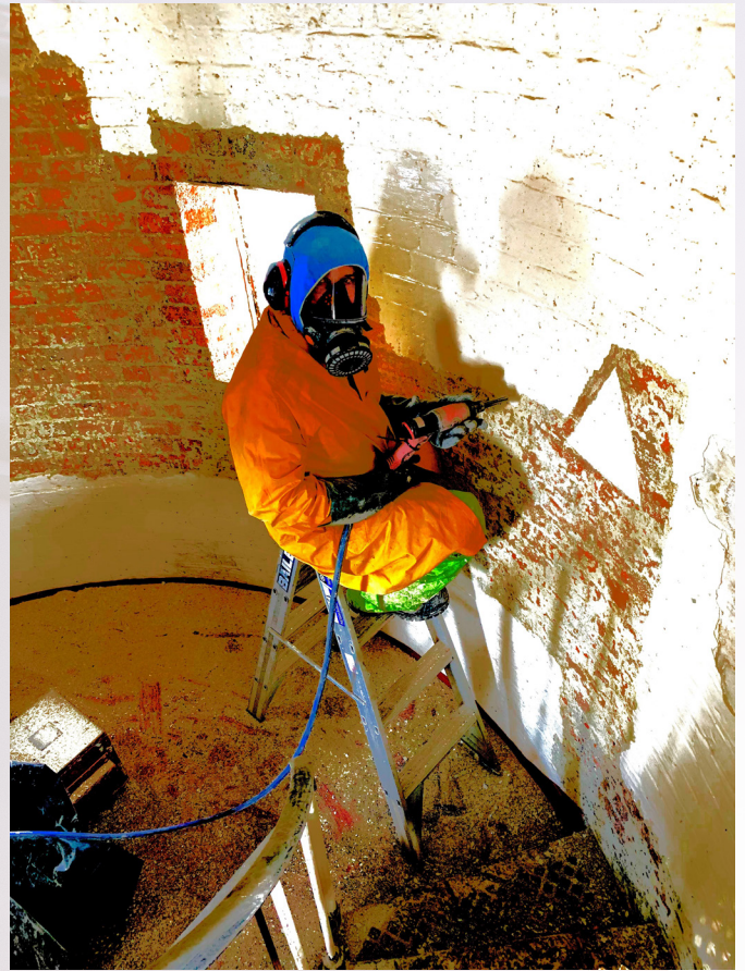
Above: Mark at work stripping the brick walls Below: completed stairs and walls