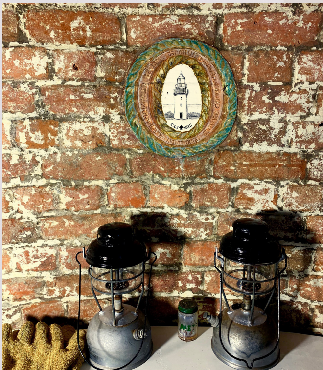
Heritage objects and Kate's Lighthouse drawing