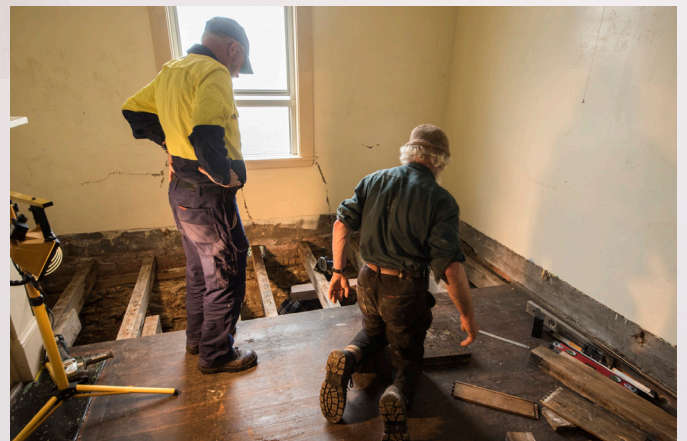
Building team at work