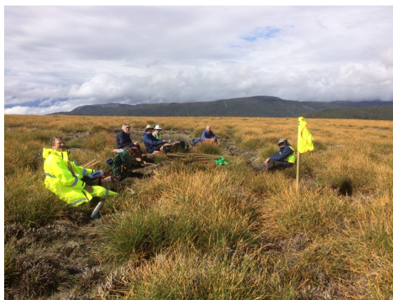
Speeler Plains near Cradle Mountain

We are concentrating on the areas north and south of the Leven Canyon that will provide some excellent walking for experienced bushwalkers as well as starting on the Leven Canyon section that received flood damage last year. Contrary to popular opinion working bees are fun...come join us for a day out and see.