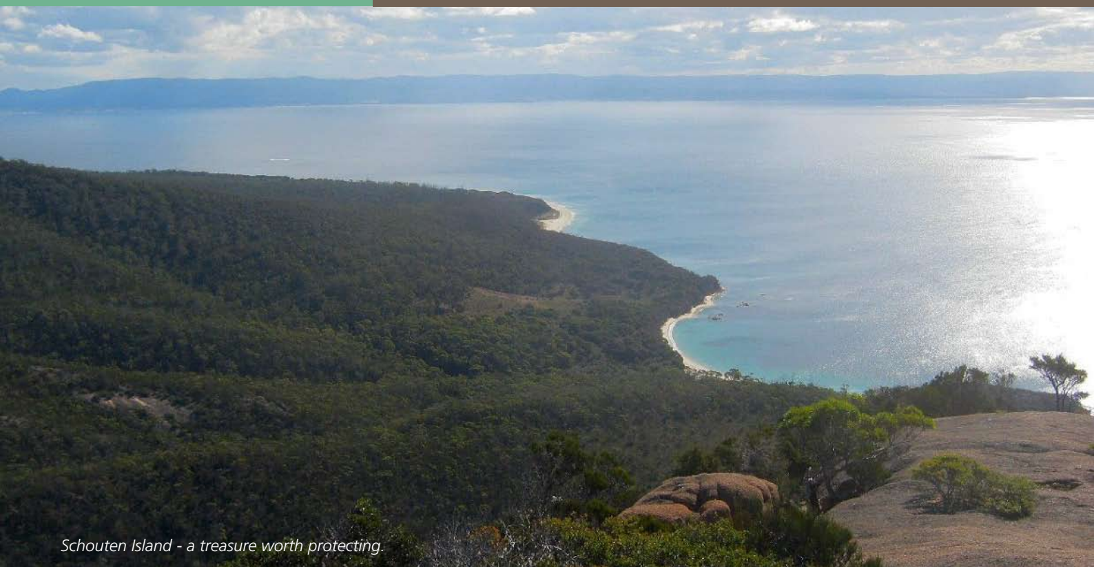
Schouten Island - a treasure worth protecting.

From the north and the south they travelled to this iconic, much visited National Park. But they did not come to gaze in awe at the granite mountains, nor the white sands, blue waters or eagles soaring effortlessly overhead. No, they came to work. Well, every now and again one or two could be seen straightening their backs and looking at the water or up to Bear Hill.