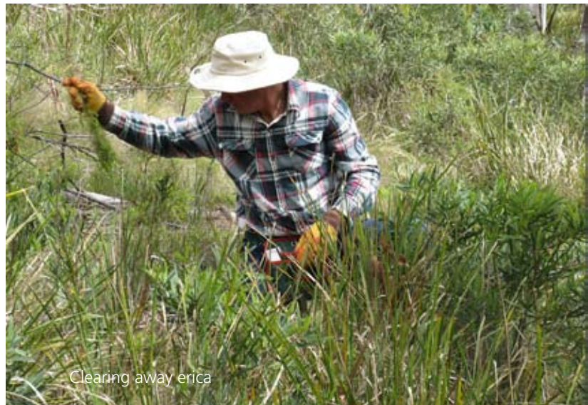
Clearing away erica