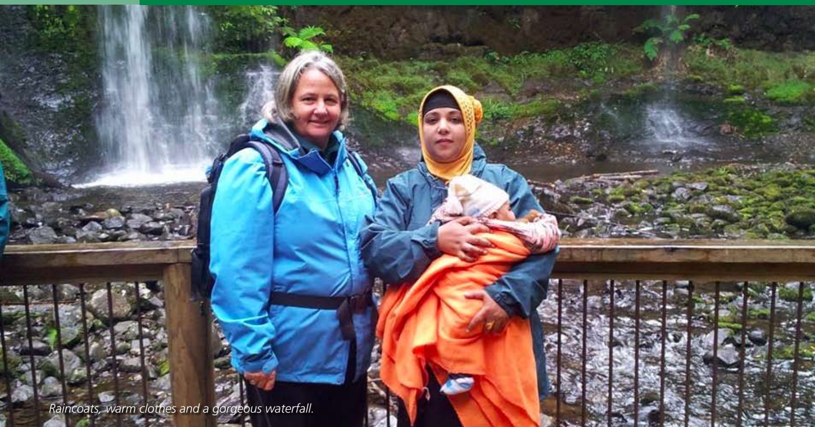
Raincoats, warm clothes and a gorgeous waterfall.