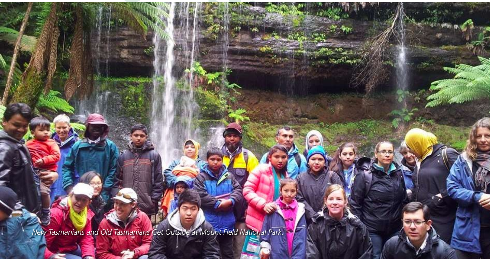
New Tasmanians and Old Tasmanians Get Outside at Mount Field National Park.

Can't wait for the next trip - keep an eye on the Wildcare website for more information.