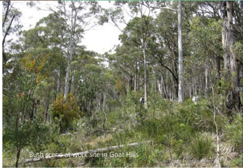
Bush scene at work site in Goat Hills

Our work this time cleared a fair proportion of the regrowth and we were able to both push back the weed free line and also scout over a large part of the bushland to remove stray Erica.