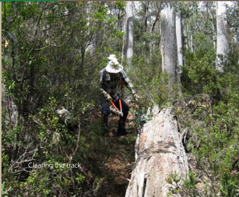
Clearing the track

We were surprised to find that someone had quite recently done quite a bit of work trimming the vegetation, but it was just long tip pruning so unfortunately, for those who did it, the effort put in was effectively wasted.