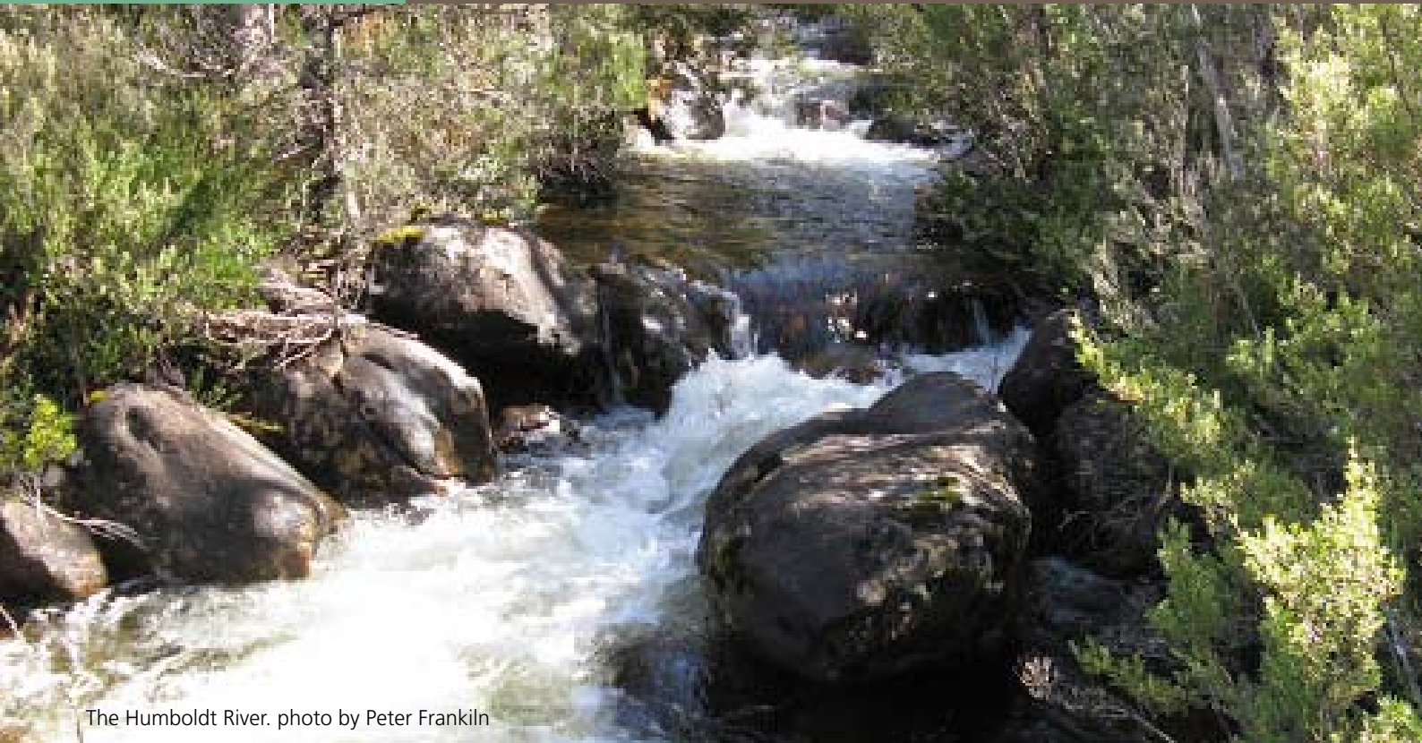
The Humboldt River.

A Friends of Mount Field project on the Lakes Belton and Belcher Track