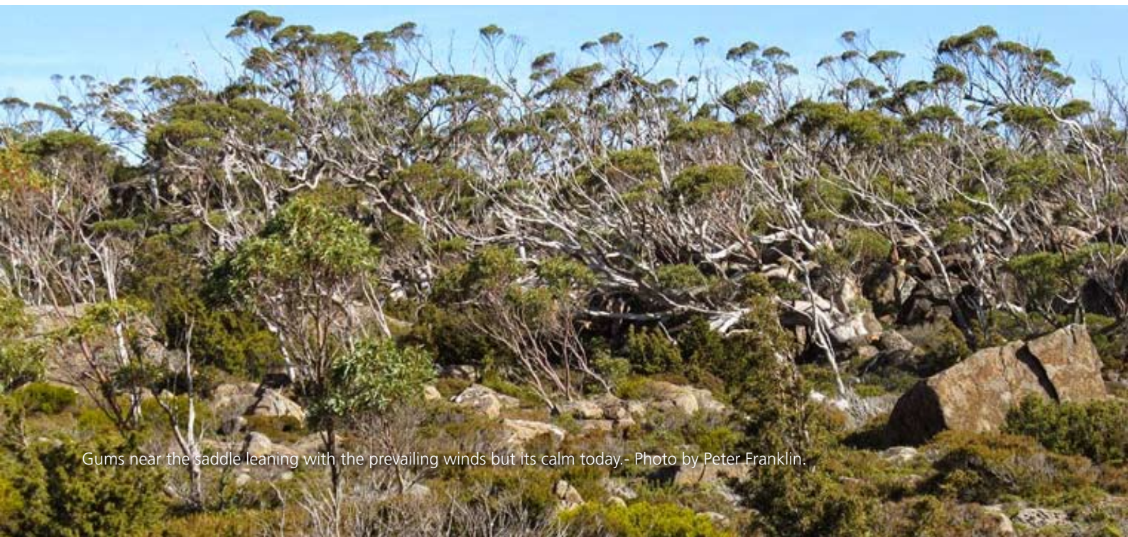
Gums near the saddle leaning with the prevailing winds but its calm today.

The day was very pleasant with little wind and clear skies. The walk in entailed crossing a very wet Wombat Moor and took us what was a bit over 1:30 to get to the work site.