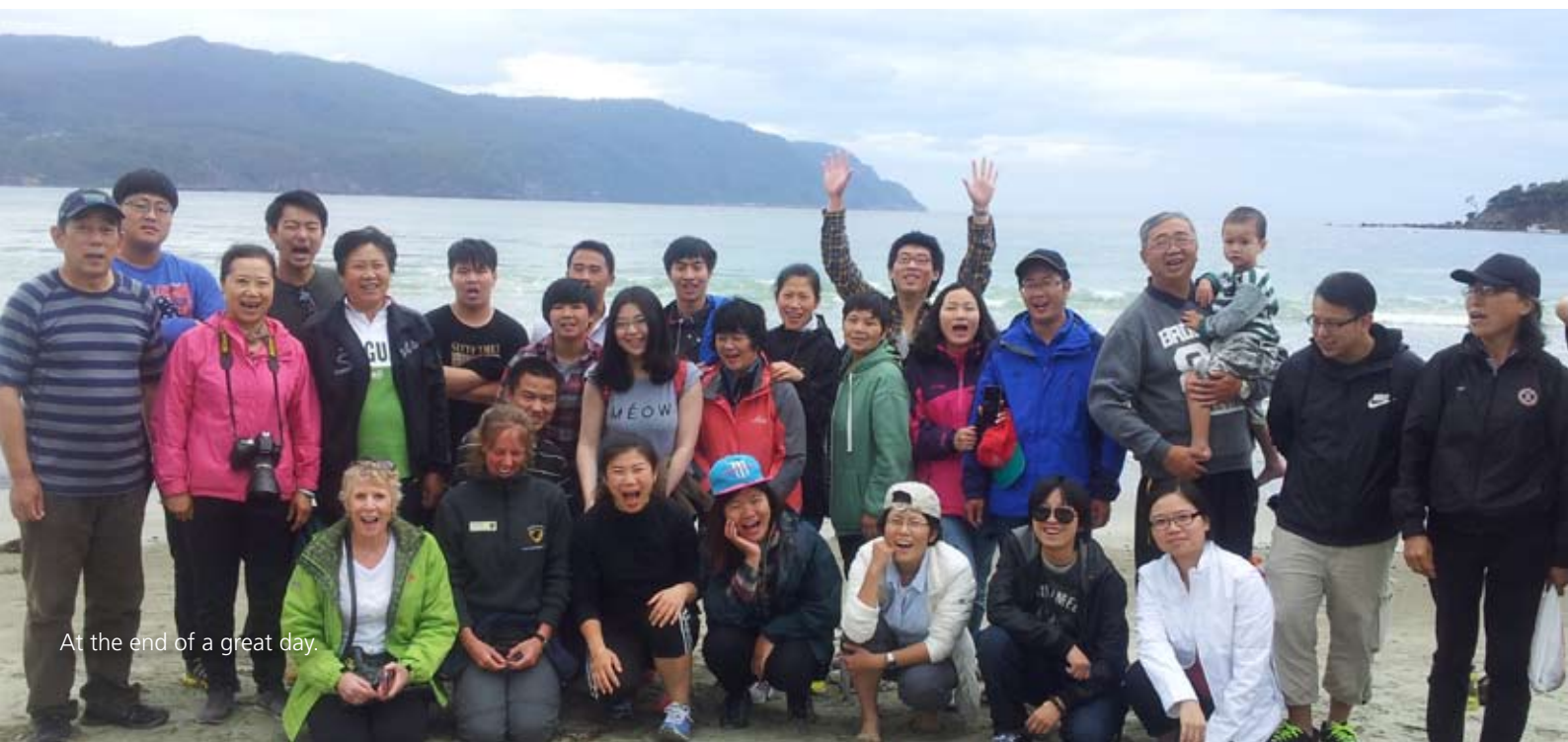
At the end of a great day.

The Get Outside will extend its leadership program this Easter in partnership with Tas Tafe - we will keep you posted.