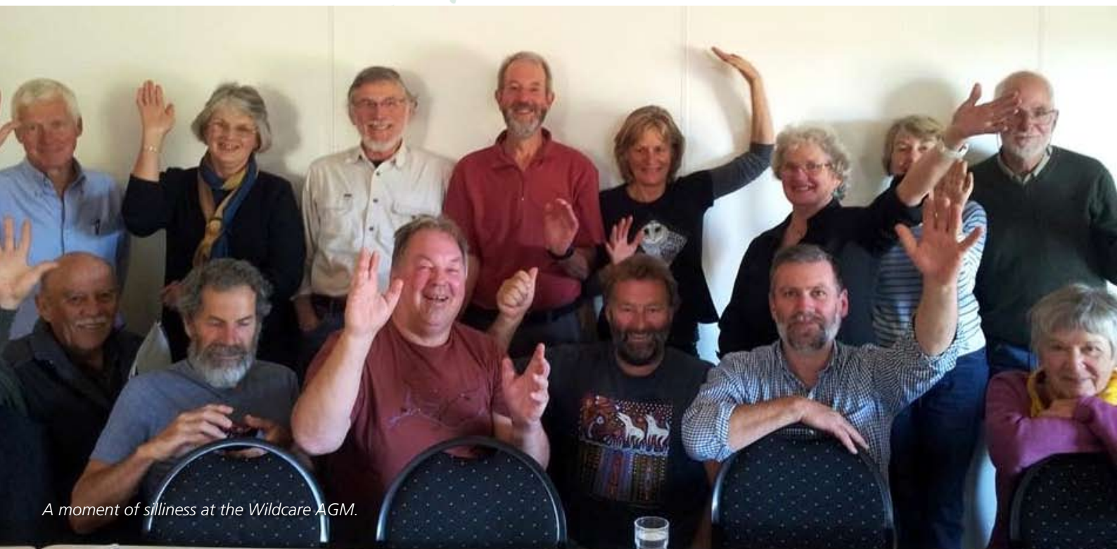
A moment of silliness at the Wildcare AGM.