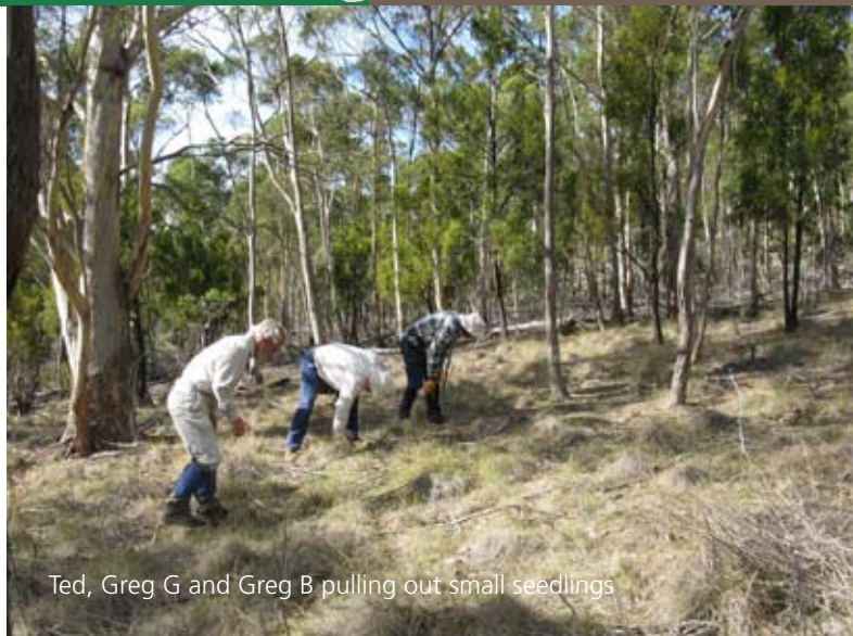
Ted, Greg G and Greg B pulling out small seedlings

At both sites most of the Spanish Heath was removed but a follow up will be required within 12 months to pounce on what inevitably were missed or that sprout in the meantime.