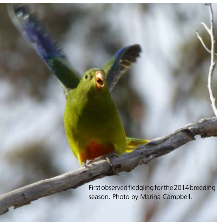
First observed fledgling for the 2014 breeding season.

This small green 'grass parrot' with its distinctive orange belly is endemic to Southern Australia and is one of just two species of migratory parrots. It breeds only in suitable habitat in the far southwest coast of Tasmania, where they nest in eucalypts bordering button grass moors.