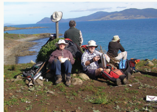
Mignonette removal at Return Point.