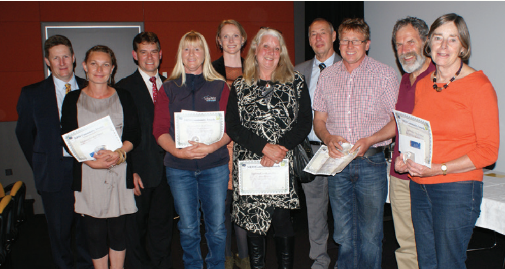
Friends of Deal Island receive the award