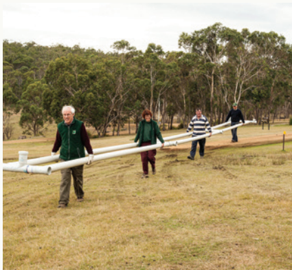
Walking the pipe grid over to the bed

FOBIQS is looking forward to completion of the next phases of the visitors facilities upgrade in preparation for another busy summer visitor season. Come and visit us over summer.