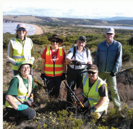
Cape Deslacs Reserve Working Bee Crew