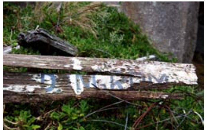
Blast from the past D Ingram