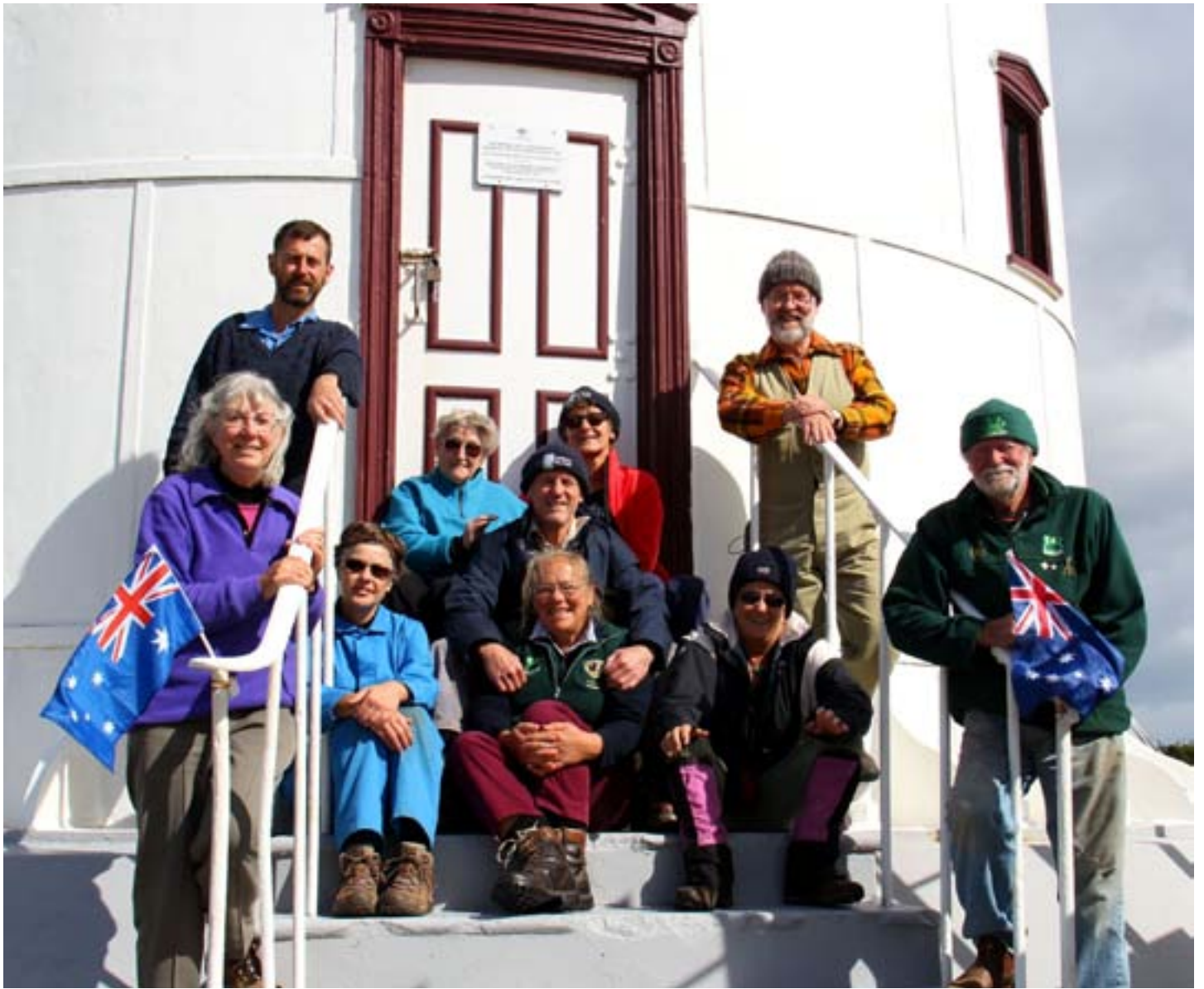
Easter working bee team Birthday celebrations Tasman light Birthday