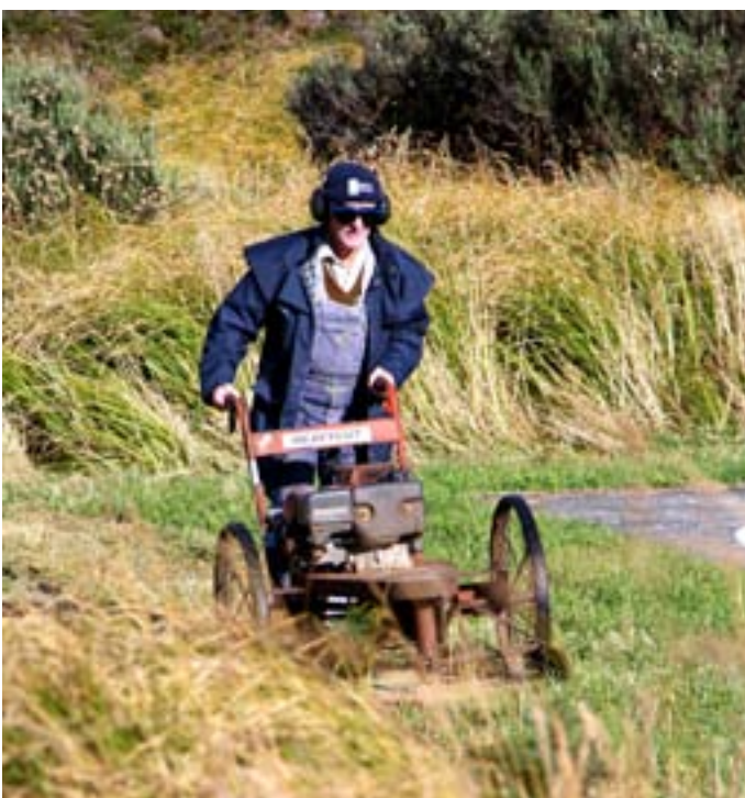
Karl Heavycut mower