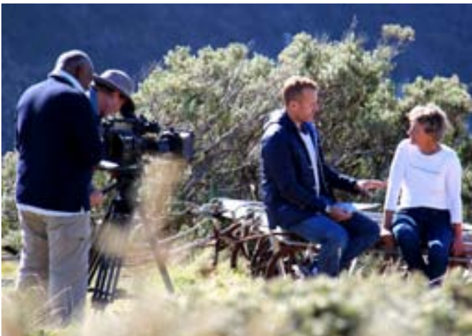
Coast Australia filming at Haulage