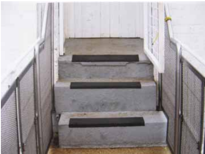
Old Steps at Table Cape

The new steps consist of four easy rises and are highlighted with yellow stripes for extra safety. The only person that had a problem with the new ones was me. Being use to the old steps I had to come to terms with one extra step and so far I'm the only person to fall up them and down them, they say familiarity breeds contempt. The only problem the guides have is now asking people to watch themselves as they come through the door, people nearly always tend to look up to see where the stairway goes and there is a small step down to the floor-well of the tower, why it was left this way I don't know but it's only a minor issue.