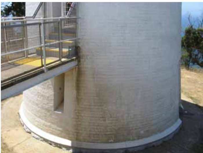
Base of tower before and after

In early April this year the tower had a paint down on the outside which has really brightened things up. The base of the tower had become very discoloured and mouldy with bits of moss growing here and there due to the lack of sun on the southern side.