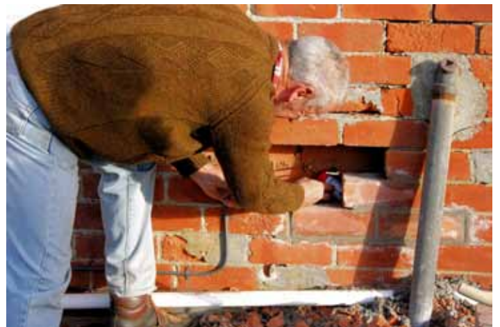
Time capsule in the wall in Q3