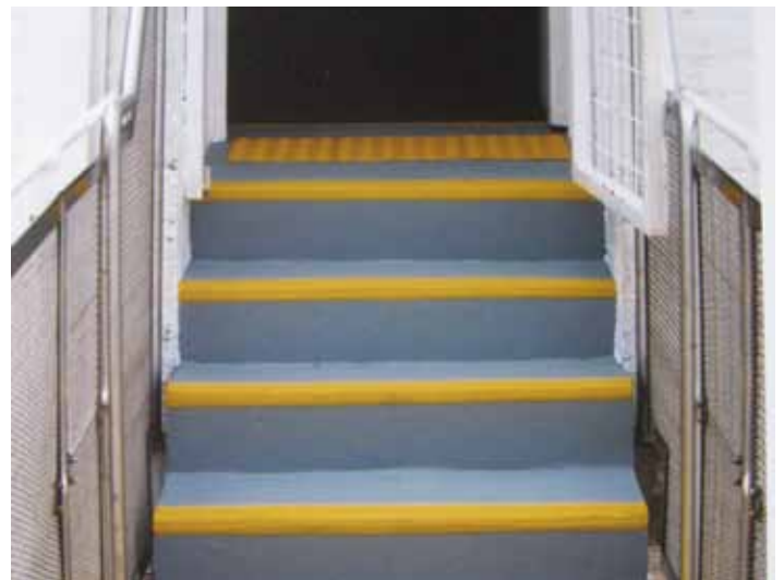
New Steps at Table Cape

In early April this year the tower had a paint down on the outside which has really brightened things up. The base of the tower had become very discoloured and mouldy with bits of moss growing here and there due to the lack of sun on the southern side.