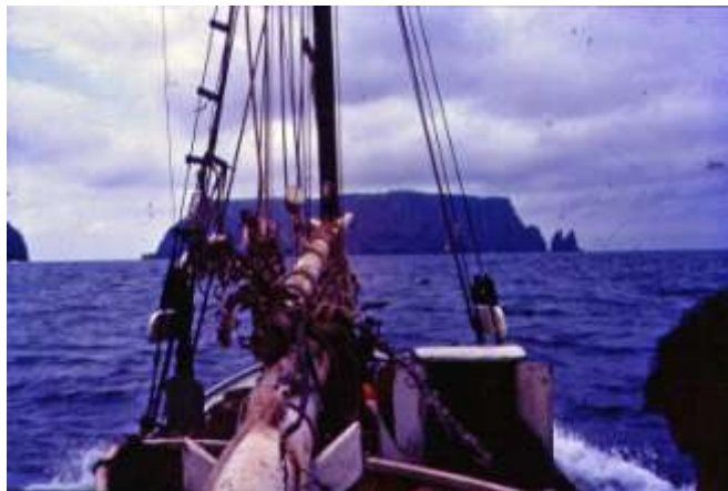
On the fishing boat going to Tasman Island (1963)