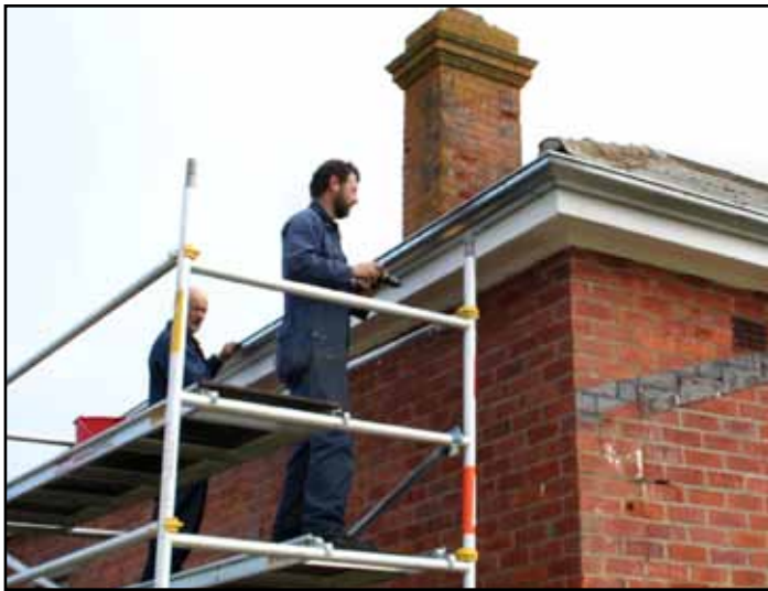
New gutters for Q2