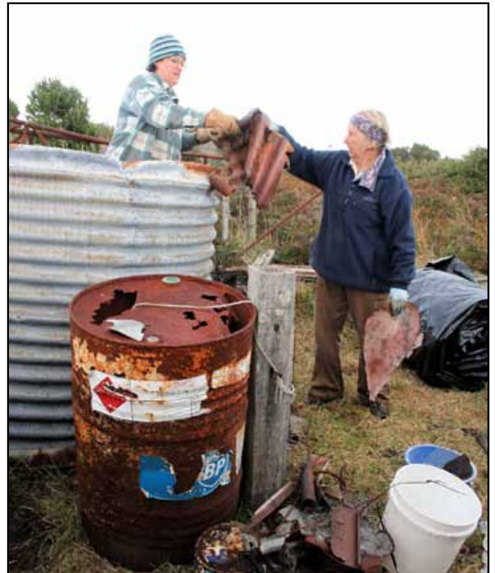
Rubbish clean up

and including, the top of The Haulage were mowed and brush cut. In addition, the track and surrounds of the Bureau of Meteorology weather station were mowed & brush cut, as well as the area around the helipad and lighthouse. To facilitate mowing and remove tripping hazards, some rocks were removed from tracks round the settlement and to improve drainage, gutters along the side of the main track were cleared by brushcutting and sprayed with weed killer.