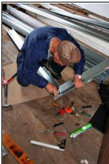
Guttering work continues