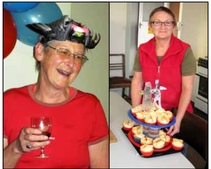
Celebrating the Royal Wedding

A fitting finale to the working bee was an evening of festivities to celebrate the Royal Wedding.