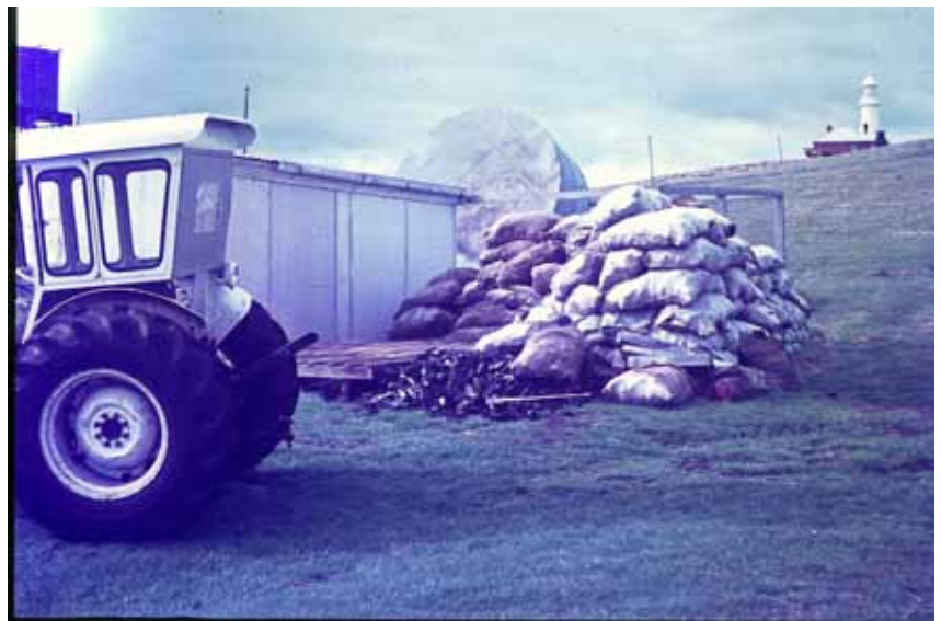
That night the wind got up .....and threw it over the shed into the chook yard

Your Dad told me the next morning it had scared the s--t out of him and your Mum. I did hear a loud boom like thunder about 9pm but thought it was the sea pounding into a sea cave."