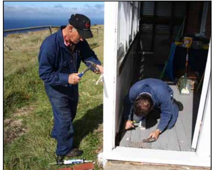
Repairs to Q3 front verandah