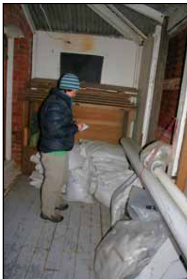
Rubbish and weed removal - thanks to funding by NRM South