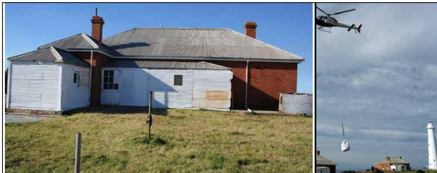
Back of Quarters 2 - the best it has looked in decades - well done

The volunteers, most first timers on Tasman Island, were taken on a familiarisation walk on our first afternoon on the island. Later in the week we viewed the seal rookery at the bottom of the ZigZag track and walked down the old haulage way to the Landing to assist Parks field officer Daral Peterson land on the rocks.