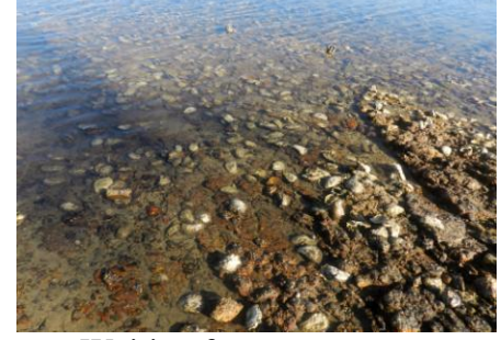
Waiting for next season