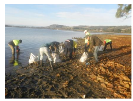
Just as well we're all young and supple.

Two more volunteers joined us after the Sun was up and sixty-six bags of oysters later we had achieved our target, with the shoreline cleared up to the big tree. Well done everyone who participated this day and all the other times over this Spring-Autumn period. And a special thanks to Mick and PLOGA for their support and participation, as well as for the egg and bacon rolls from Windy's.