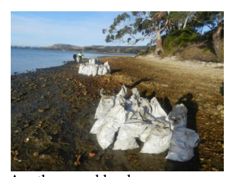
Another good haul

Two more volunteers joined us after the Sun was up and sixty-six bags of oysters later we had achieved our target, with the shoreline cleared up to the big tree. Well done everyone who participated this day and all the other times over this Spring-Autumn period. And a special thanks to Mick and PLOGA for their support and participation, as well as for the egg and bacon rolls from Windy's.