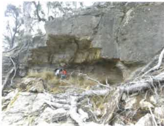
Investigating a cave on a walk.