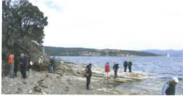
Friends of Bruny Island Quarantine Station walk and talk.

The pontoon is now installed and operational. Signage advising of the conditions for use will also be installed.