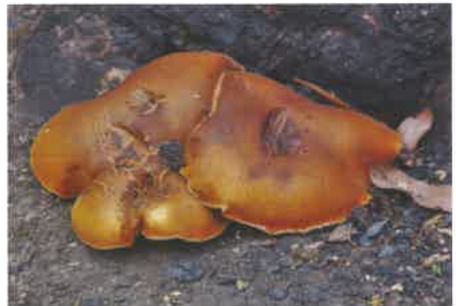
Laccocephalum hartmannii at tree base, seen in the reserve for the first time.