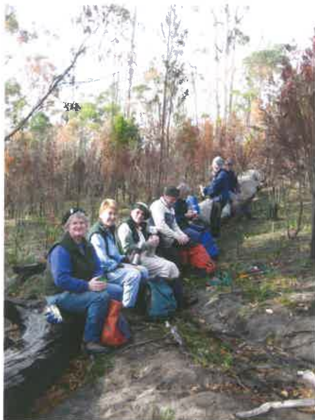
Friends of Coningham have time for a cup of tea.