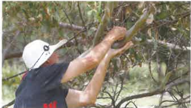
Back in the tree.