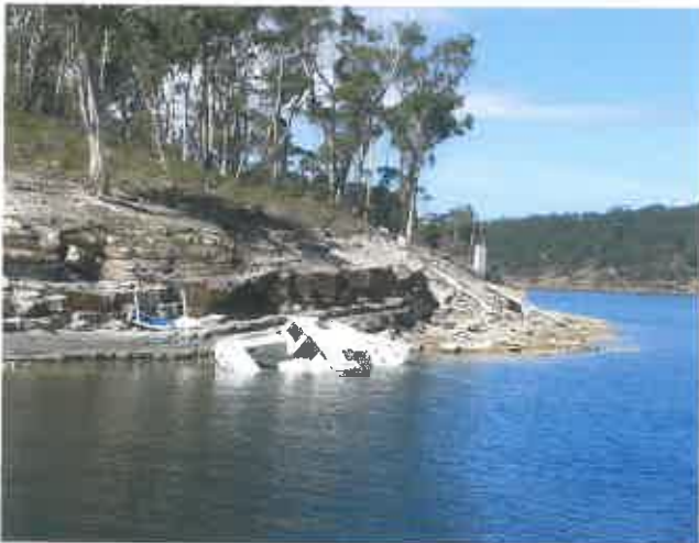
Our commiseration's to this boat owner.

The ability for people to gain access by land and by water is a good step forward as it is also a step back to the past, when the only access to the Station was by sea.