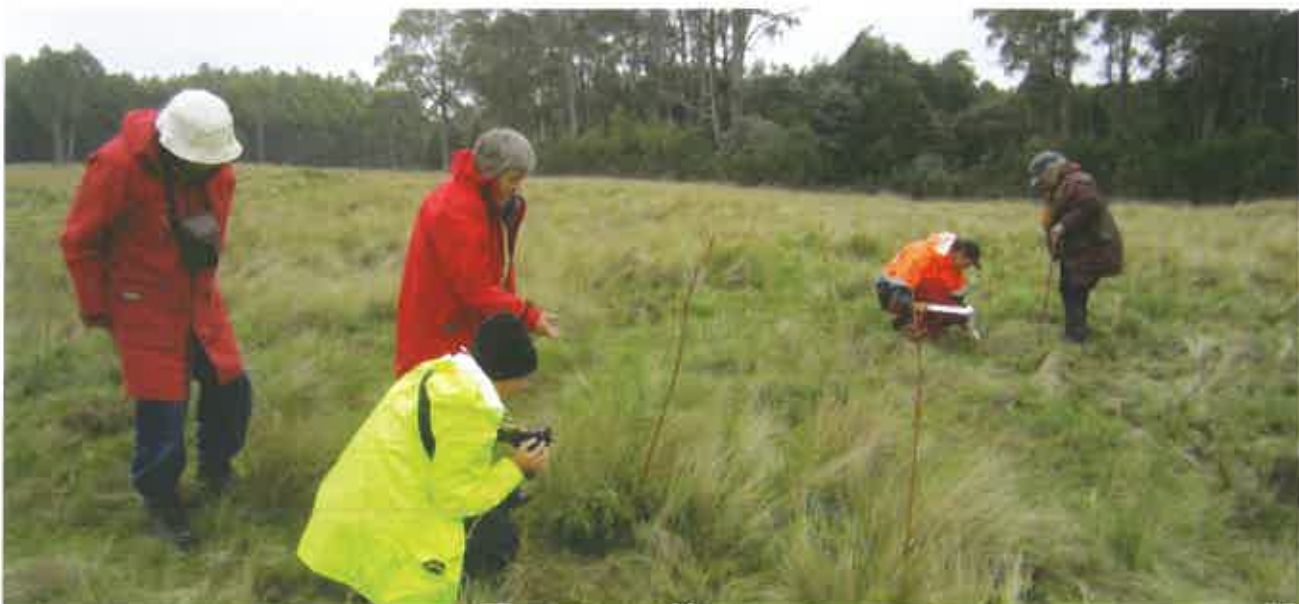
Volunteers monitoring the crowded leek orchid at Surrey Hills, January 2013.