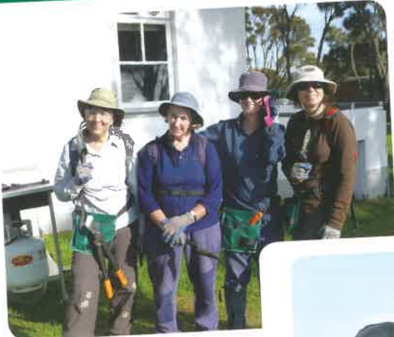
Hats, tools and smiles are all a volunteer needs (well nearly all).