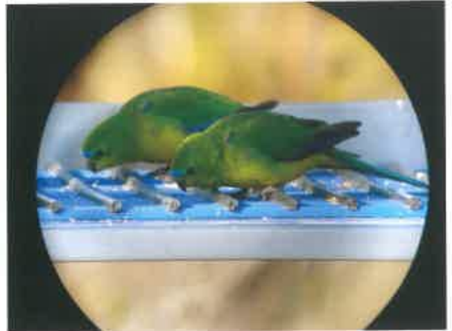
The view through the scope - OBPs feeding at the feed table.

best chance to survive. In the early 1980s, a captive population was established and now stands at close to 330 individuals in six different institutions across south-east Australia.