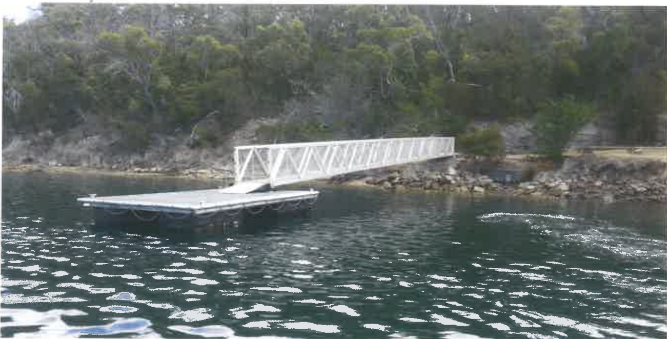
The newly installed pontoon at the station.