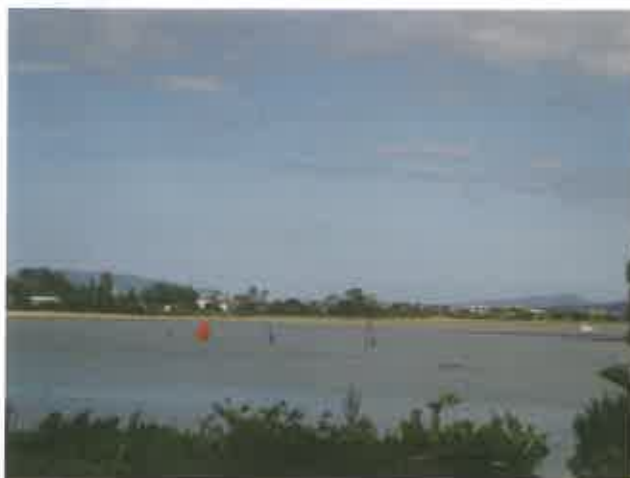
The View from Lumeah Point.

It has always been maintained by individual residents who looked after the patch outside their fence but gradually feral oysters, dust, weeds and access have become issues to be dealt with.