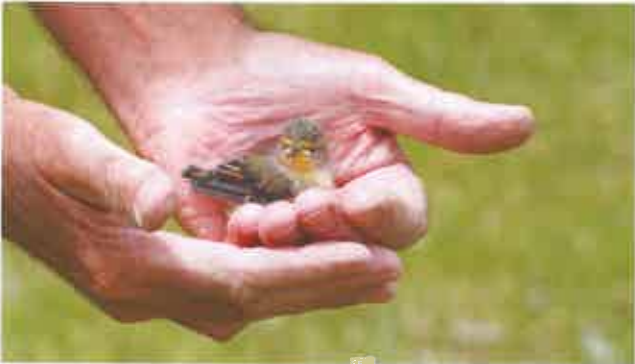
Rescue from predator.