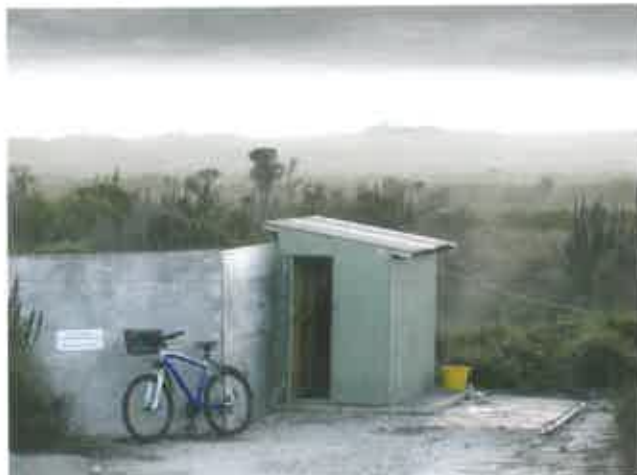
The volunteer's bike parked outside the bird hide during an early morning monitoring session.

The OBP National Recovery Team provides advice on implementation of the recovery program, giving the OBP the