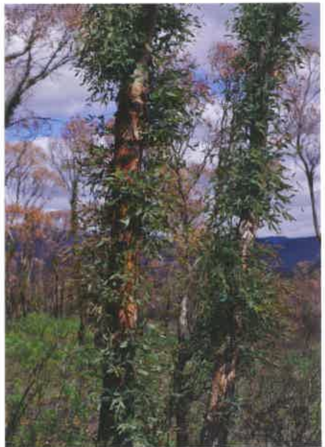
Sprouting of Eucalyptus amygdalina.