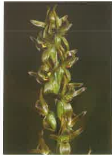
The endangered crowded leek orchid, Prasophyllum crebriflorum.