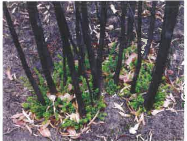
Early and fast recovery at the base of burnt teatree stumps.