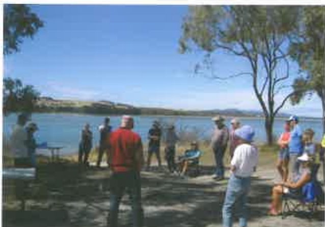
The first meeting of the group and the sausage sizzle - yum!

Our first event is being held on Sunday 6 April when we start tackling the feral oyster problem with the assistance of Pipeclay Lagoon Oyster Growers Association (PLOGA) and Windsurfing Tasmania.