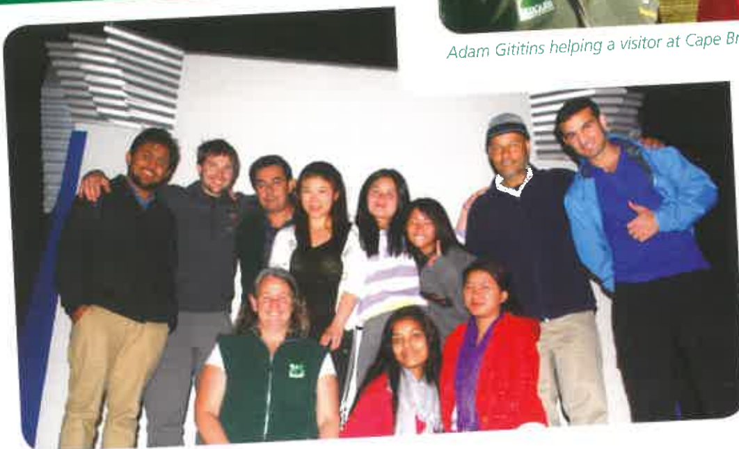
Get Outside - leadership training.