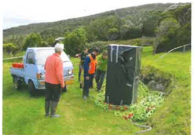
The new fridge arriving on Maatsuyker Island after being transported in a net under a helicopter.

Please see another story on the Island Arc Symposium on page 18.