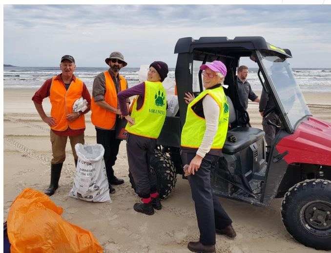
Modelling Wildcare safety vests!

Maintaining the strong relationship with Parks and Wildlife Service (PWS) continues to be a focus for the Board. This was flagged in last year's Annual Report and many hours have been spent on enhancing the relationship by both Wildcare and PWS. Around two thirds of our activity is on PWS managed land and they remain the most important land manager for our organisation.