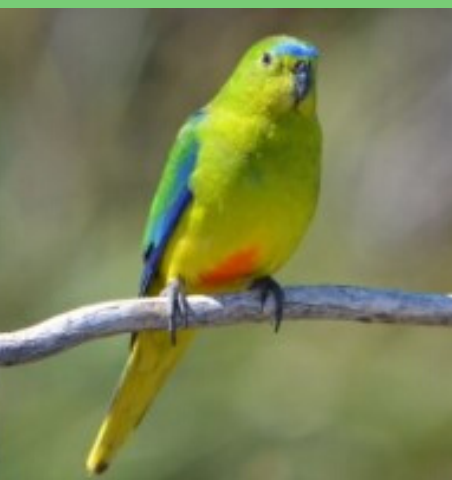
Wildcare collects donations for the care and monitoring of the endangered orange-bellied parrot.

Each Wildcare group is a 'branch' of the Wildcare 'tree' and has access to the Wildcare customer relationship management software to communicate with members and to advertise upcoming events. The Wildcare Office team provides governance, web, marketing, procedures, insurance, financial management services, grant administration, training and general support and advice.