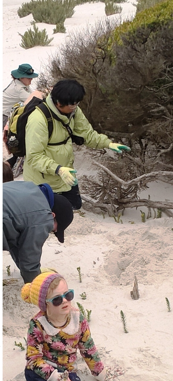
The 2019 Irapuna coastal weeding and clean-up attracted people of all ages

During 2019, there were 12 different causes to donate to. The largest quantity of donations received in 2019 were to wildlife related causes. We give particular thanks to our natural partners, Hilary and Alan Wallace, Saffire Resort, Pennicott Wilderness Journeys and RACT. Donations from the public helped us significantly in growing funds available for onground works.