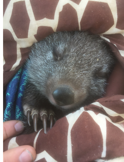
at Bonorong Wildlife Sanctuary

Wildcare issued over $100,000 in grants during 2019