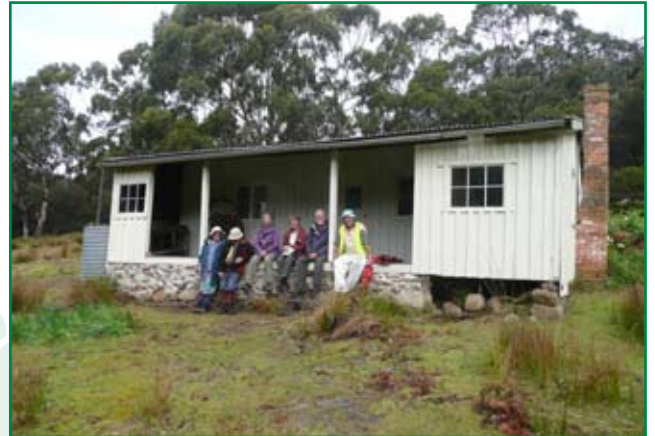
The volunteer team at Robeys farmhouse