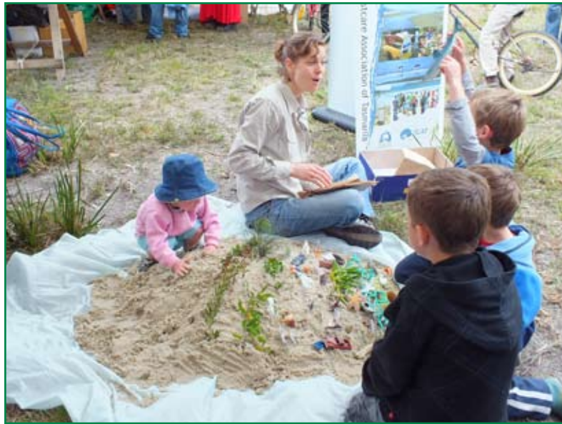
Never too young to learn about the coast

We thought it would be fun to invite other organisations to join us and so on the big day – Saturday 15 th October - we were joined at the Reserve by Kingborough Council, the Southern Coastcare Association of Tasmania (SCAT), NRM South, the South East Tasmanian Aboriginal Corporation (SETAC) and local group Coningham and Lower Snug Community Association (CALSCA).