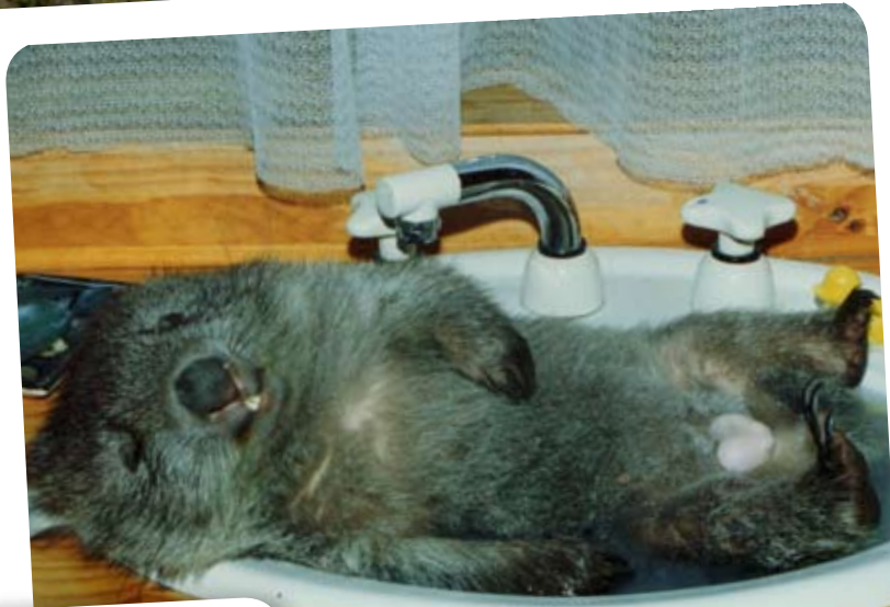
Wombats Like a Bath. See more on page 4