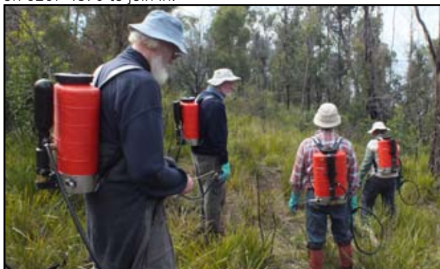
Coningham Volunteers Off to Work