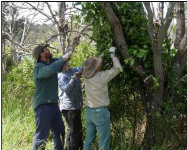
Snake Island Volunteers Hiding Blackberry Canes

Long serving volunteers from the Friends of Snake Island (aka Tasmanian Sea Canoeing Club!) paddled and rowed to this small island close to the North Bruny coastline in the D’Entrecasteaux Channel recently to check on the weed status of the island. Just to prove you can’t turn your back on these nasties they spent most of the day removing vigorous blackberries, eating cake and chatting between spring showers and bright sunshine. Interested in assisting this group: contact Jean Jackson on 6223 7446