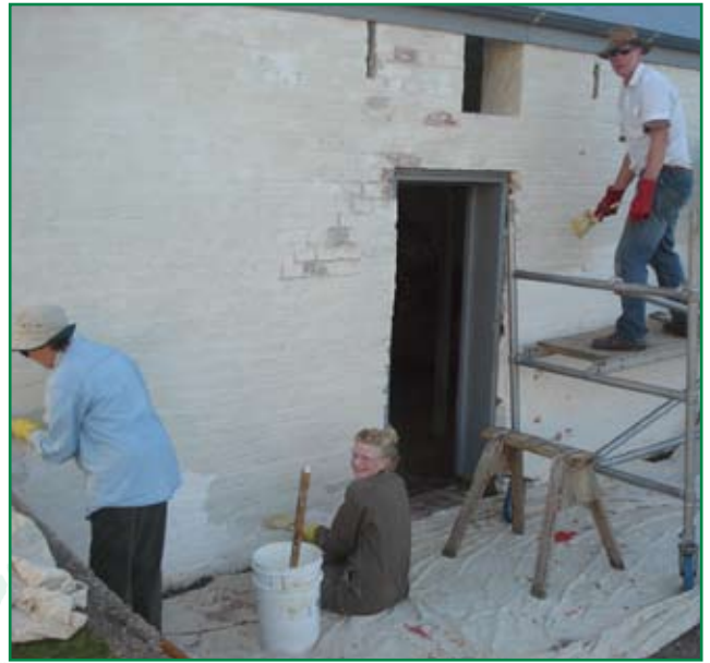
Maria Island volunteers test their lime wash skills