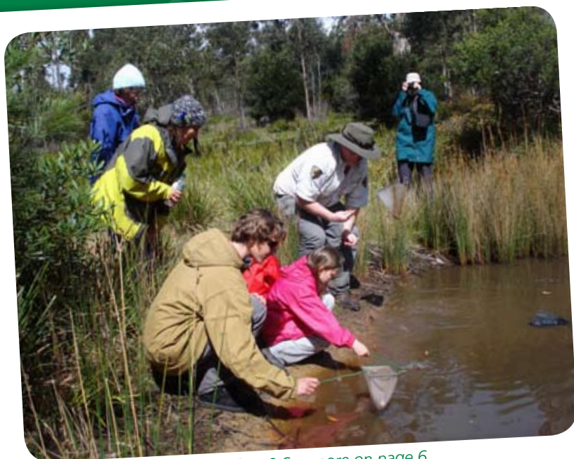
What's Happening at Coningham? See more on page 6