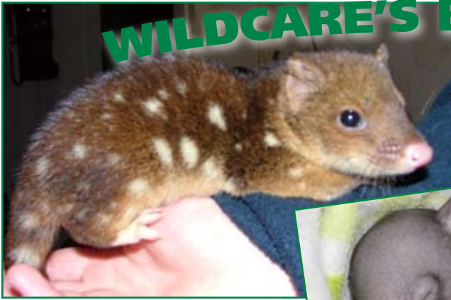
Judy Synnott's eastern quoll