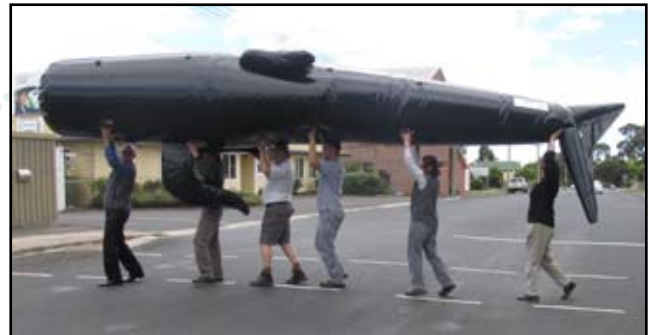
Pilot Whale Crossing the Street in Ulverstone

The training whale was very quickly put into 'service' with its first outing at a training day at Orford on 13 November as part of the Triabunna Seafest festival.