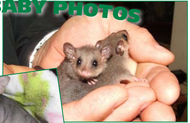
Julia Butler-Ross' pygmy possums