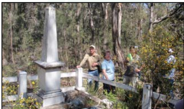
Volunteers inspect memorial at Bruny Quarantine Station