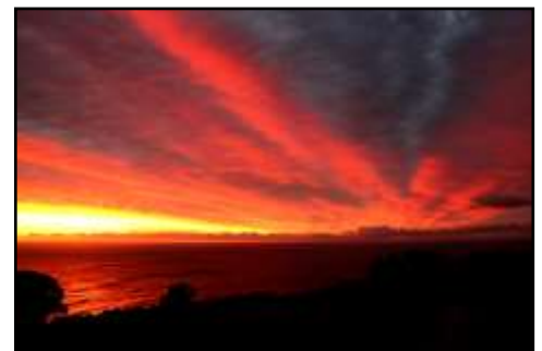
Nature put on its best colours