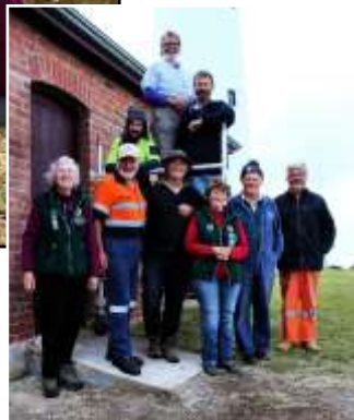
Team 2 3 - 7 April