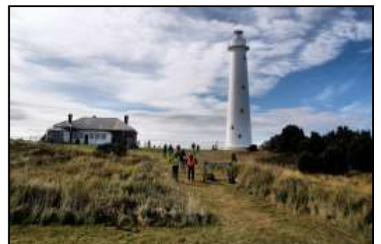
Take-off from Tasman Rotary Day Saturday 7th May