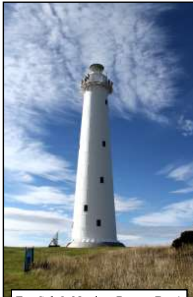
For Sale? No, just Rotary Day!