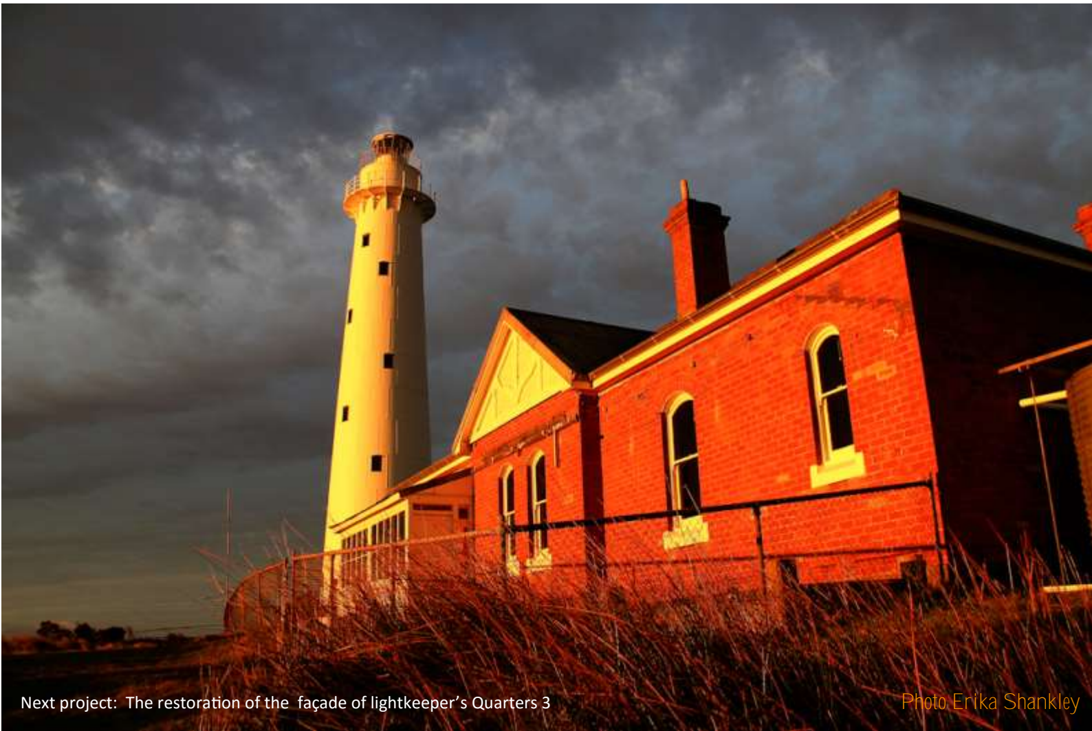
Next project: The restoration of the façade of lightkeeper's Quarters 3