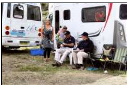
The Rotary team confer at Safety Cove