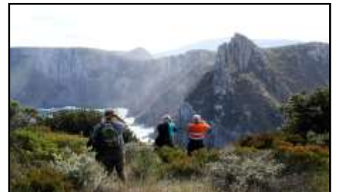
Taking in the view over Cape Pillar & the Blade