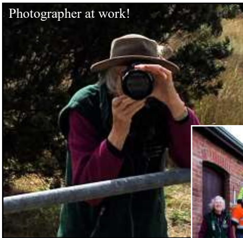
Photographer at work!