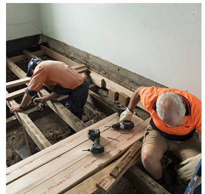
FOMI volunteers repairing the historic quarters