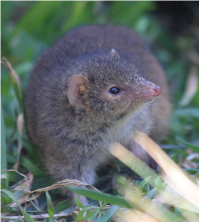
Swamp antechinus ( Antechinus minimus minimus )

We care about the island. Even if some of us never go there, we want to know that the historic buildings are being conserved, the Aboriginal heritage is acknowledged and respected, and the Island's animals, plants and marine environment are protected.