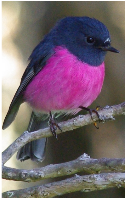
Pink robin ( Petroica rodinogaster ) on Maatsuyker Island

Maatsuyker Island has Australia's most southerly lighthouse and was the last in Australia, in 1996, to be demanned