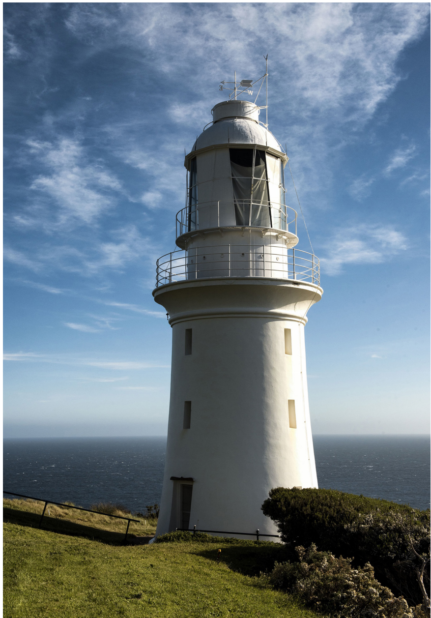
In partnership, FOMI and PWS carried out extensive restoration of the Maatsuyker Island lighthouse in 2016