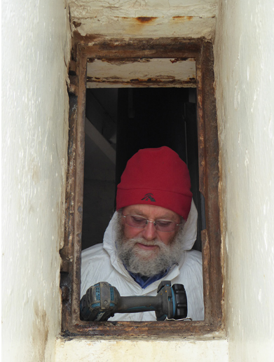
PWS volunteer caretaker working on restoration of a window in the lighthouse