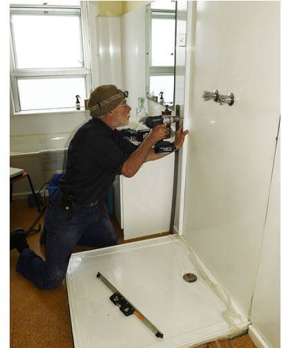
FOMI volunteers repairing the historic quarters, lighthouse and weeding