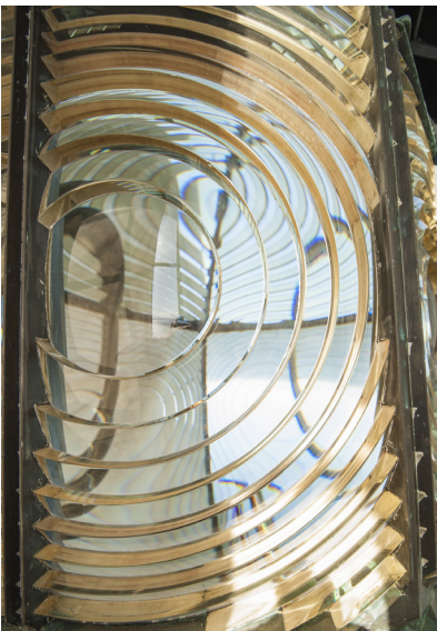
Maatsuyker Island lighthouse prisms, first order fresnel lens