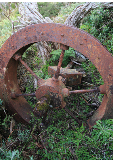
Original haulageway whim