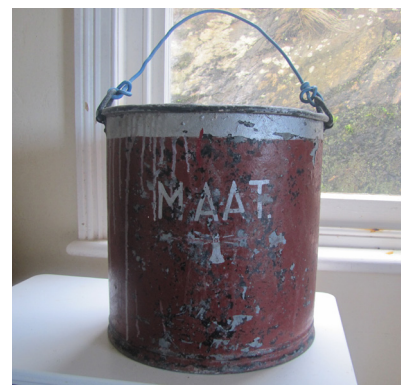
Historic objects located and documented 2013 and 2017