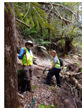
Brookes Track (left) / Mt Lorymer (right)