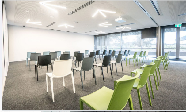
The Penguin Parade Visitor Centre - symposium location.