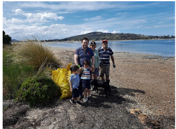
Wed 23 rd Team