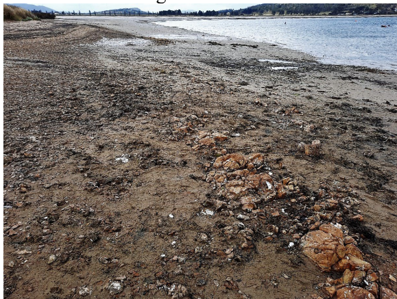
Where we've been