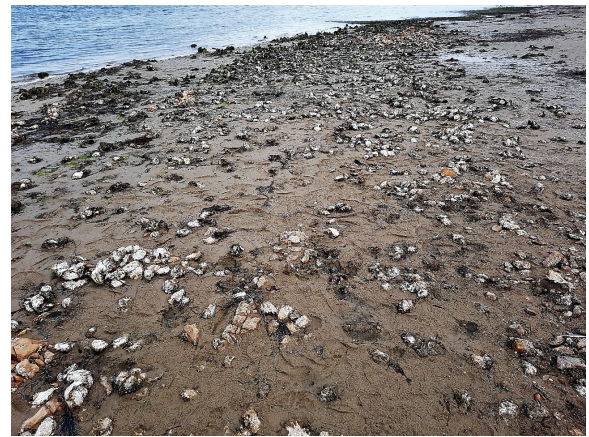
Where we're going