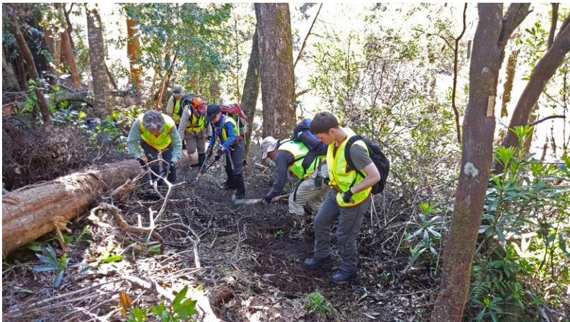
Restoring track surface ...