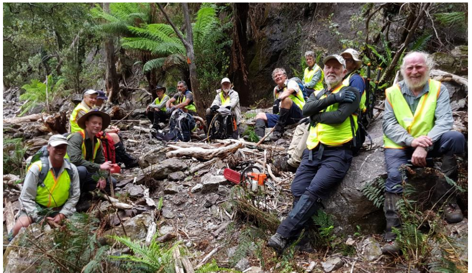
The crew ... afternoon break and still smiling

Yep ... we're on the track, it's gotta be here somewhere!