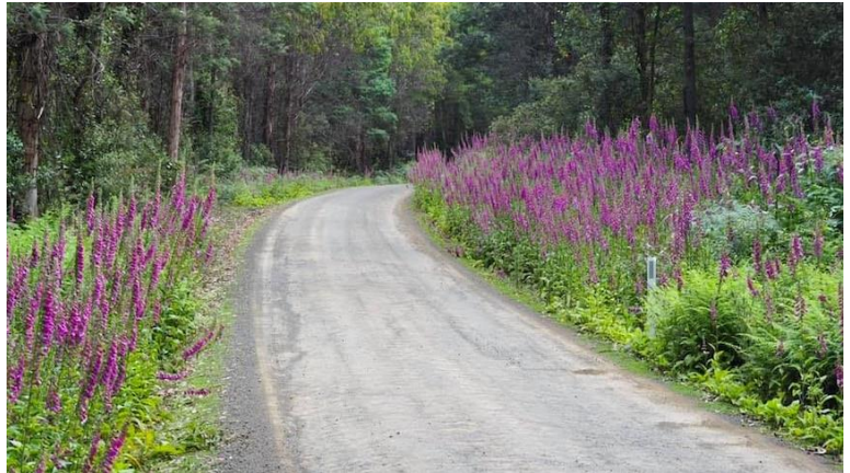
OR catastrophe (road in the Liffey Falls area)

On recent walks and working bees the number of plants invading roads, tracks, paddocks and cleared or disturbed land is alarming. An area passed recently along the Leven River that had probably several hundred plants two years ago now has an estimated 20,000 plants.