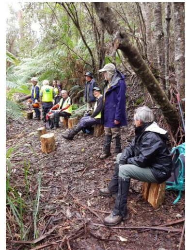
Have chainsaw, have dining setting ...