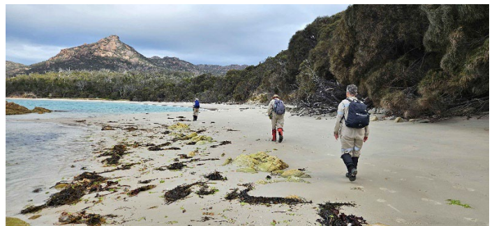
back on Moreys Beach, nearly home

Due to changing weather conditions later in the week, the group was extracted from the island on Monday 18 th . This meant we only had five days weeding, not enough time to cover all areas, but we did tackle the worst areas, and even managed a trip to the western side of the island weeding as we went.