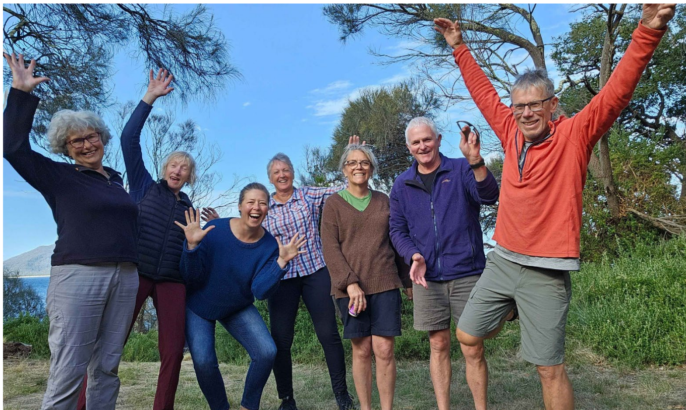
Still smiling at the end of the week!