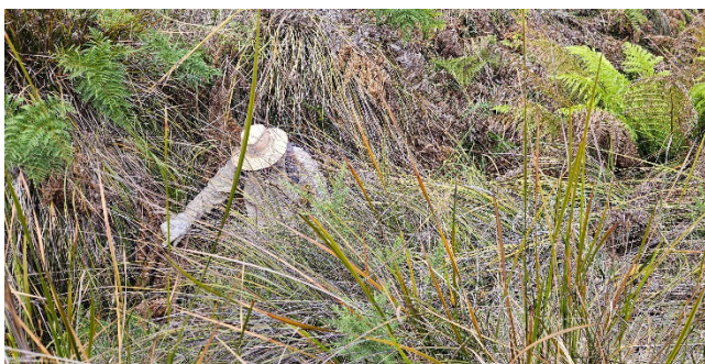
sometimes it's hard work getting to the gorse

Downtime saw plenty of swimming, strolling along the beach, and a trip up Bear Hill for some.