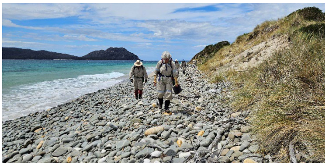
rounding Sandspit Point enroute to the western side of the island